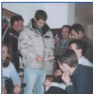
The young people in an Open House meeting