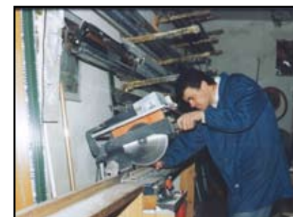
A returnee in the working place

INFORMATION, COUNSELING AND SUPPORT ON REINTEGRATION OF RETURNED AND INTERNAL MIGRANTS