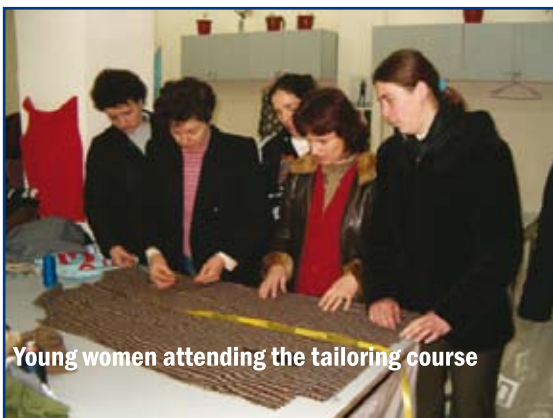
Young women attending the tailoring course

Geographical spread: 16 districts of Albania